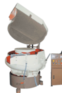
Shown with optional sound cover